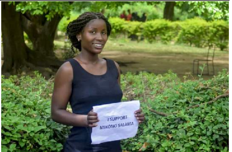
RDVA member support Mikono Salama Campaign

RDVA is the association of students from various programs at SUA. They engage in volunteering activities within and outside the university campuses with reference to Governing laws, By -laws, university rules and regulations and one of the areas of their concern is environmental protection.