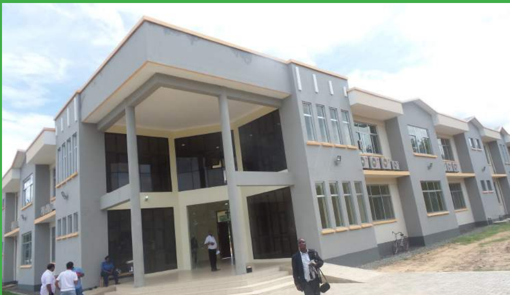
The New Laboratory Building of Department of Biosciences and Department of Chemistry & Physics at Solomon Mahlangu College of Science (SM-CoSE)