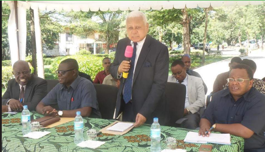
Chairman of the Council Hon. Mohamed Chande Othman talk to members of staff and students of Sokoine University of Agriculture on 8th March 2018