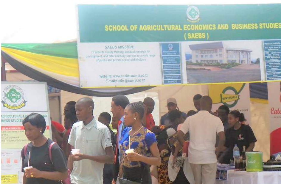
Pavilion of the School of Agricultural Economics and Business Studies (SAEBS) during Sokoine Memorial Week.

Sokoine died on 12 April 1984 at the age of 45 years in Morogoro when his car collided with another vehicle on the road from Dodoma to Dar es Salaam.