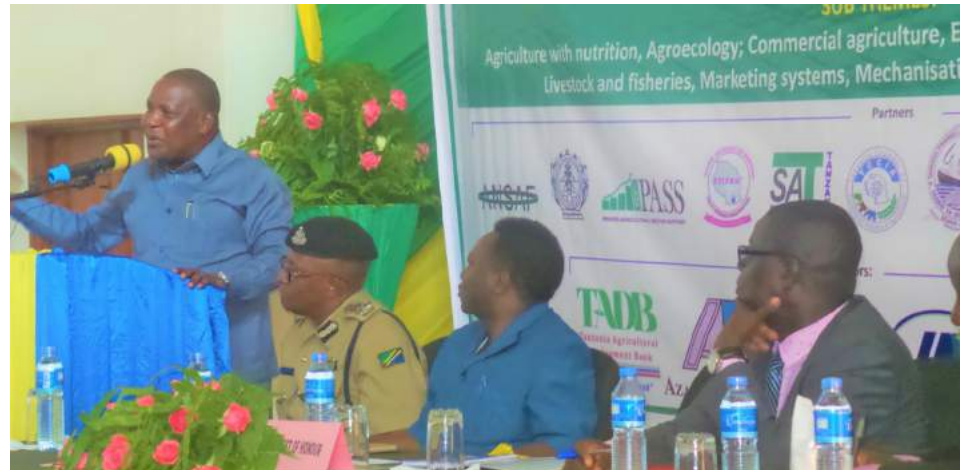
Tanzania Minister for Agriculture and food. Hon. Charles Tizeba giving his speech on Sokoine Memorial Week opening Ceremony

In 1967 he became Deputy Minister of Communication, Transportation and Labour. The next step in his career was the promotion to the Minister of State in 1970.