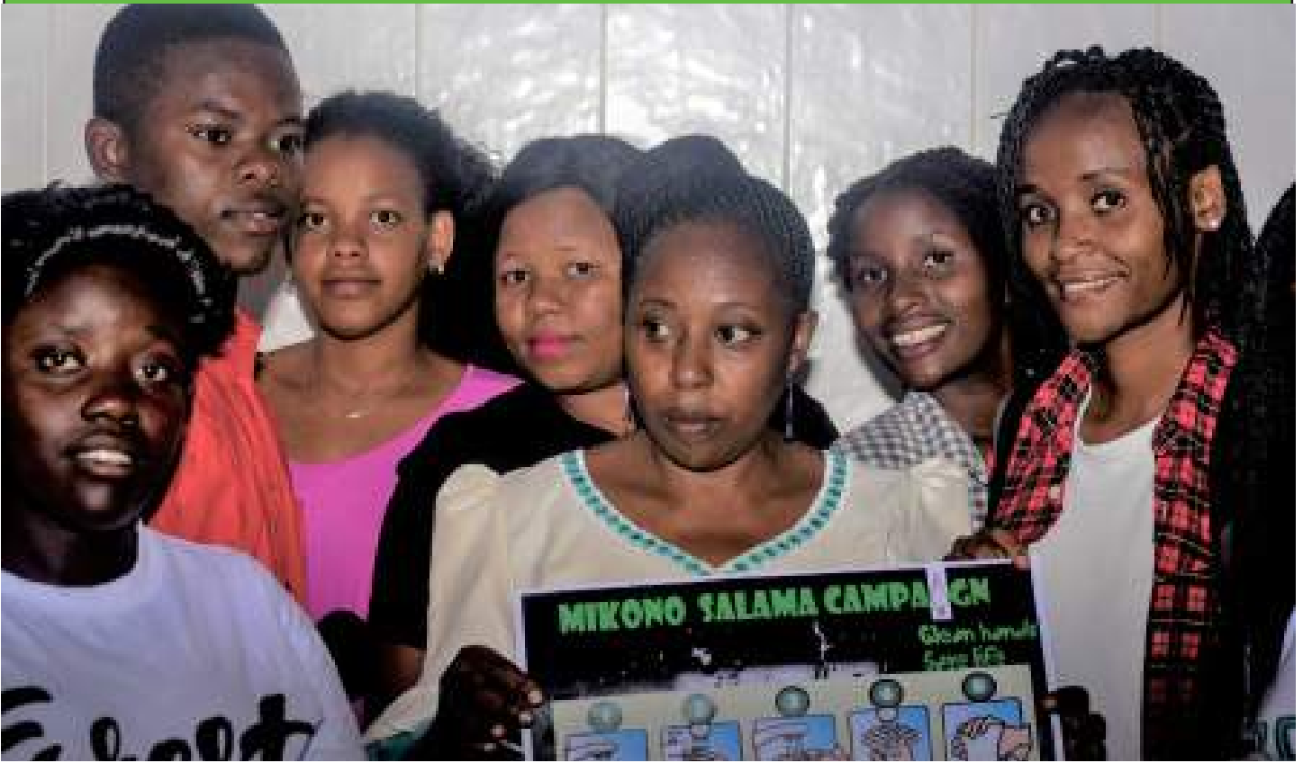
The Dean of students and member of Rural Development Volunteers Association (RDVA) during the campaign of Mikono Salama.

Mikono Salama Project encourage s and educates people on the importance of washing hands soon after toilet and before eating. The project under RDVA has built Tippy taps and demonstrates how to wash hands primary schools pupils.