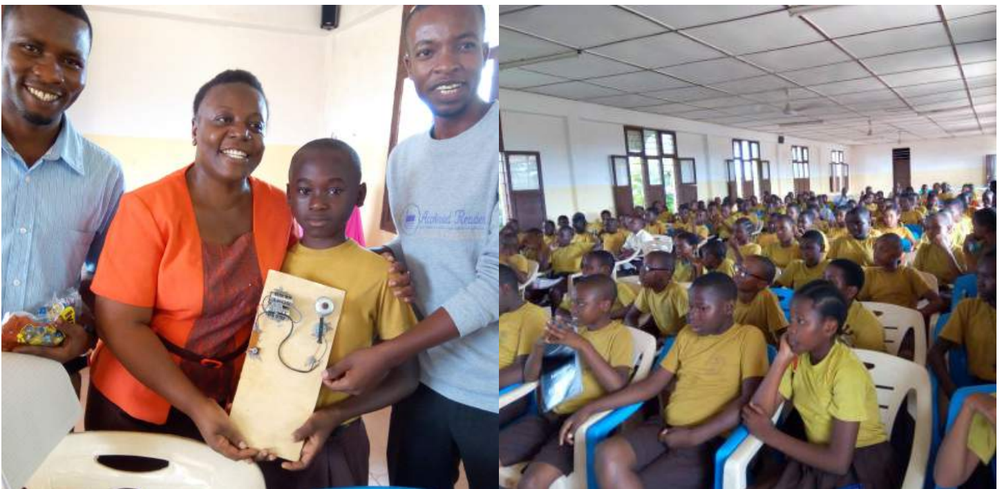
A Creative Student from Carmel Primary School Designed Electronic Bell