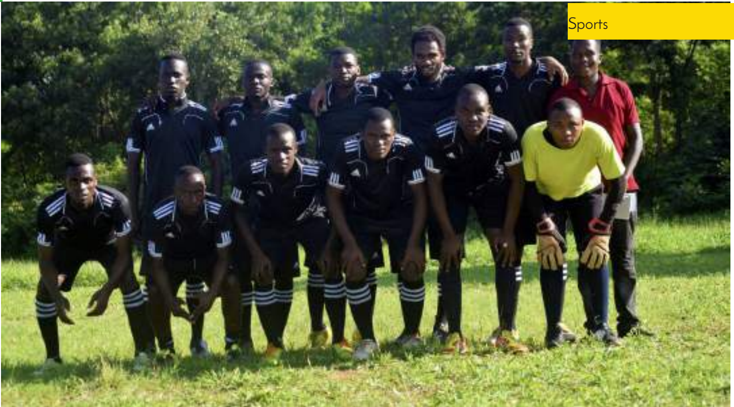
Team of Agriculture Engineers from Sokoine University of Agriculture (SUA) participated on SUA Stamina Cup